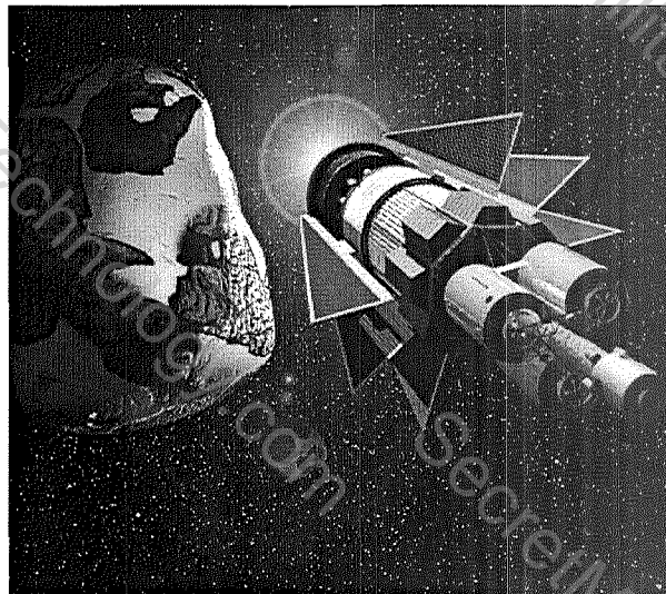
FIGURE 3. Asteroid deflection maneuver.

Several technical issues and trades must be addressed in order to define even a Mark I vehicle. These are the type of pulse unit, its degree of collimation, detonation position and fissile burn-up fraction. These issues dictate propulsion efficiency and drive design of the vehicle's mechanical elements. Another issue is the pusher plate-plasma interaction. The amount of ablation experienced during each pulse could be significant and would dramatically affect I_{sp} and thrust levels. Other issues include shock absorber efficiency, timing and dynamic response. Reusability will be important, so component wear must be kept to a minimum. In-space assembly, earth-to-orbit launch packaging and pulse unit safety and loading also must be addressed. Most of these issues have been investigated in the past and, although engineering challenges still remain, there are no formidable technical problems to overcome.